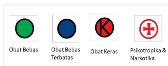
Image 1. Signs of Hard Drugs

A medical prescription is required to acquire hard drugs and to dispense them through a licensed pharmaceutical employee. According to letter c, article 24, of government regulation no. 51 of 2009 concerning pharmaceutical work, “pharmacists have the power to administer hard drugs, narcotics, and psychotropic substances to the public on medical prescription, under applicable laws and regulations.” 20 Article 145, paragraph 1, of Law no. 17 of 2023 on health also specifies that “pharmaceutical personnel is required to carry out pharmaceutical practice in compliance with laws and regulations”. 21