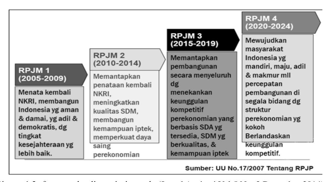
Picture 1.2: stages and policy priority scale (Jurnal Aspirasi Vol 5 No. 2 Desember 2014)

Further, RPJPN 2005-2025 is implemented in 4(four) stages of middle term development plan (RPJM) which formula and policy priority direction can be seen in picture 1.2 below: